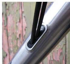
Top: Neatly CNC-machined rear dropouts with rack and mudguard mounts Bottom: Cables and rear brake hose run through the frame via reinforced entry ports either side of the down tube