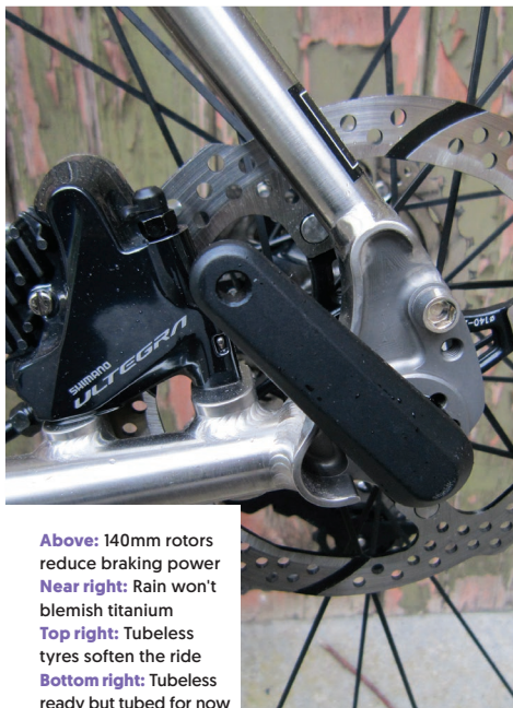
Above: 140mm rotors reduce braking power Near right: Rain won't blemish titanium Top right: Tubeless tyres soften the ride Bottom right: Tubeless ready but tubed for now

At Cycle, we are proudly independent. There's no pressure to please advertisers as we're funded by your membership. Our product reviews aren't press releases; they're written by experienced cyclists after thorough testing.