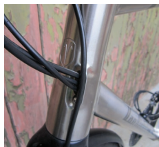
Top: Tidy and well made forged thru-axle dropouts, with mudguard/rack mounts Bottom: The entry port for the brake hose and gear cables is on the head tube. There's an access plate under the bottom bracket for ease of installation

little more power and a lot of sponginess. On my 25% grade brake-test hill, the GTD's smaller, lighter rotors quickly overheated and the levers came back to the handlebar by the bottom. Okay, I weigh 86kg, but when riding off-road on gravel or when carrying luggage, I'd want better braking.